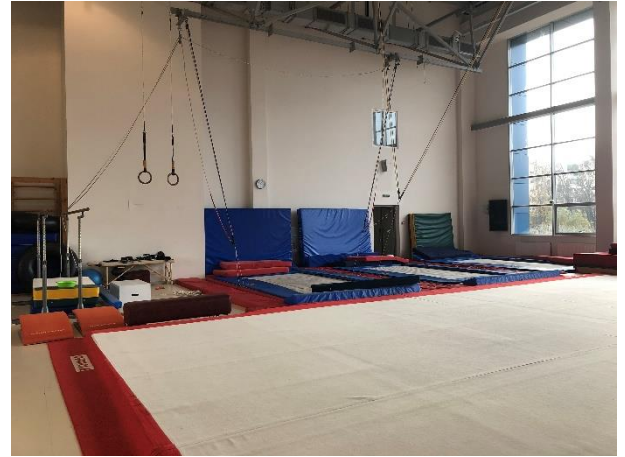
4 x springboards and foam blocks pool, 3 floor level trampolines