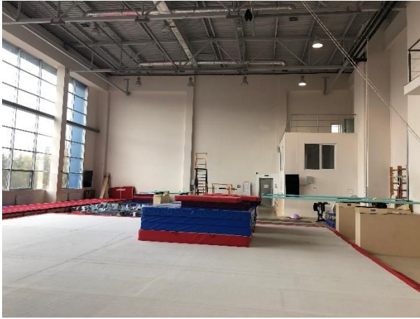
1 & 3m variable height platform, acrobatic path (ski-run track)