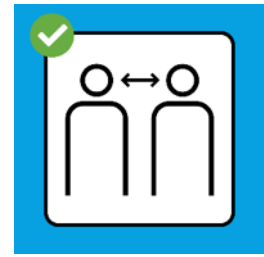
Keep your 1.5m distance