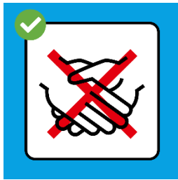
Avoid shaking hands, hugging, kissing