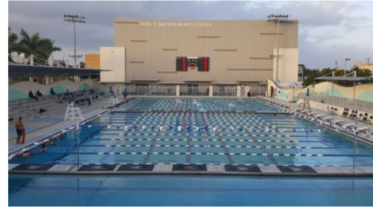
Azura Training Centre, USA