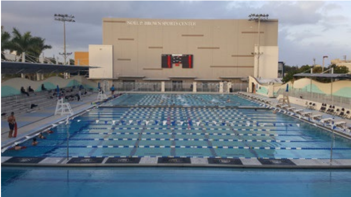
Azura Training Centre, USA