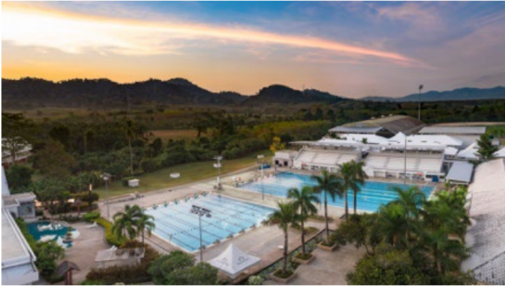
Thanyapura Training Centre, Thailand