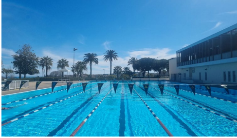
Antibes Training Centre, France