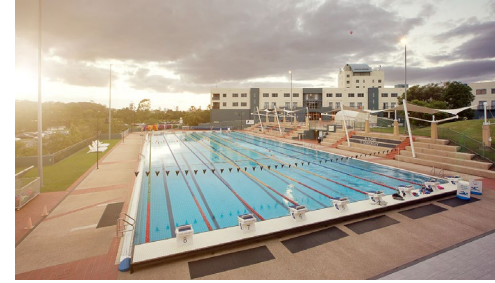
Bond University, Australia