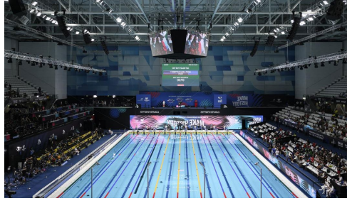
Budapest Training Centre, Hungary