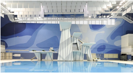
Toronto Training Centre, Canada