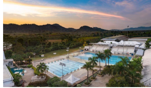
Thanyapura Training Centre, Thailand